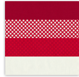
Rail Fence Diagram

Each rail fence unit should measure 6½" × 6½".