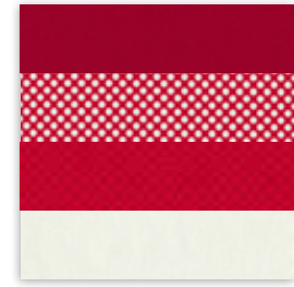
Rail Fence Diagram

Each rail fence unit should measure 6½" × 6½".